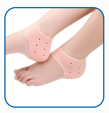
ANTI CRACK SILICON GEL HEEL CUPS