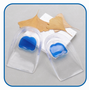
GEL HEEL CUPS PAIR FOR MEN