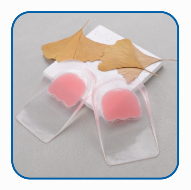
GEL HEEL CUPS PAIR FOR WOMEN