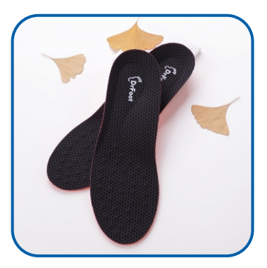
ARCH SUPPORT GEL INSOLE