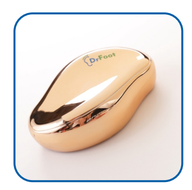
GLASS FOOT FILER CALLUS REMOVER