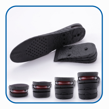
HEIGHT INCREASING SHOES INSOLES