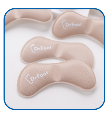
HEEL CUSHION PADS