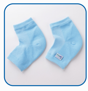
GEL HEEL SOCKS