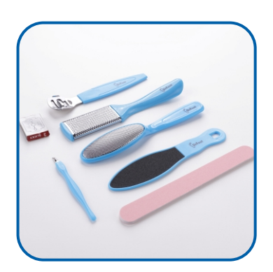
8 IN 1 PEDICURE