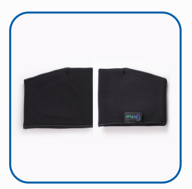
GEL SLEEVES CUSHION PADS