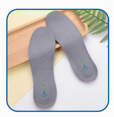
GEL INSOLES PAIR