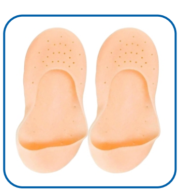
SILICONE HEEL SOCKS