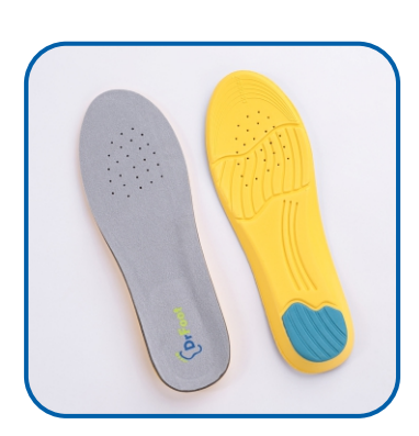
GEL INSOLES PAIR